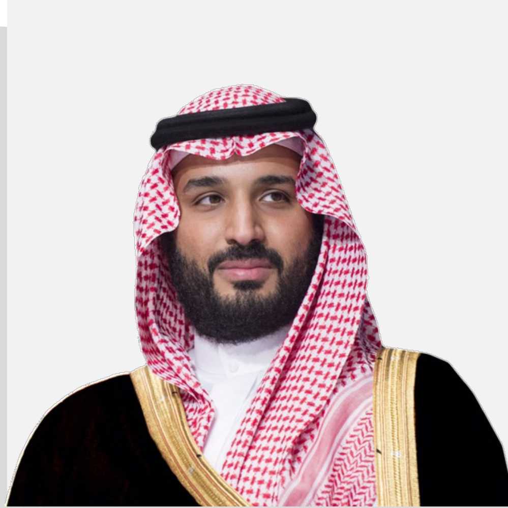
His Royal Highness Prince Mohammad bin Salman bin Abdulaziz Al Saud

Custodian of the Two Holy Mosques, The King of the Kingdom of Saudi Arabia